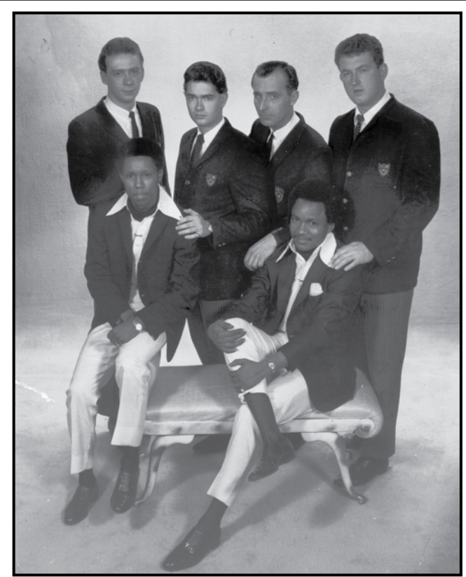
Element Of Sound, circa mid 1970s.

and 'Never In A Million Years' are two other lost treasures, mid-tempo numbers that find Parker emoting with full-throated expressiveness. These songs were released by Secret Stash Records as part of an M-Pact collection in 2015