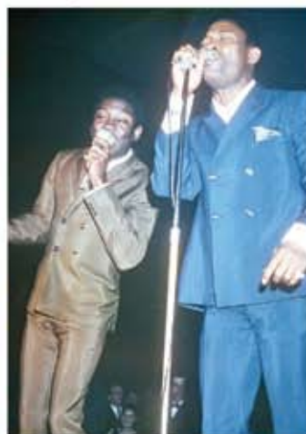
Dave Prater and Sam Moore (Sam & Dave)