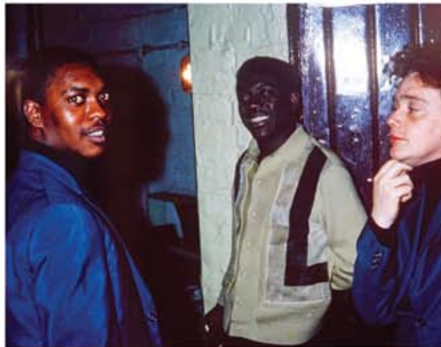
Booker T, Dave Prater and Donald 'Duck' Dunn