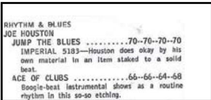
From Billboard, 1952.