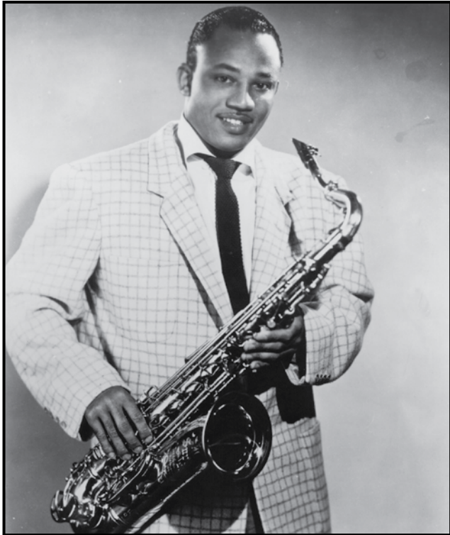
Joe Houston circa mid 1950s.

I n 1951 as greater Los Angeles was getting ready for the era of the honking saxophone, a 26-year-old Texas tenor sax player known variously as the 'Wild Man Of The Sax' and 'Mighty' Joe Houston arrived to kick-start the scene. Born in Austin, Texas on 12th July 1926, Joe recalled: "I don't remember when I didn't play the tenor sax. I lived in a neighbourhood of professional musicians in Austin, Texas. I started playing trumpet in a high school band for six months. I couldn't learn fast enough. So I got a saxophone. About nine months, I was playing saxophone. I started playing saxophone by the age of eleven and when I was fourteen, I was sitting in a club.